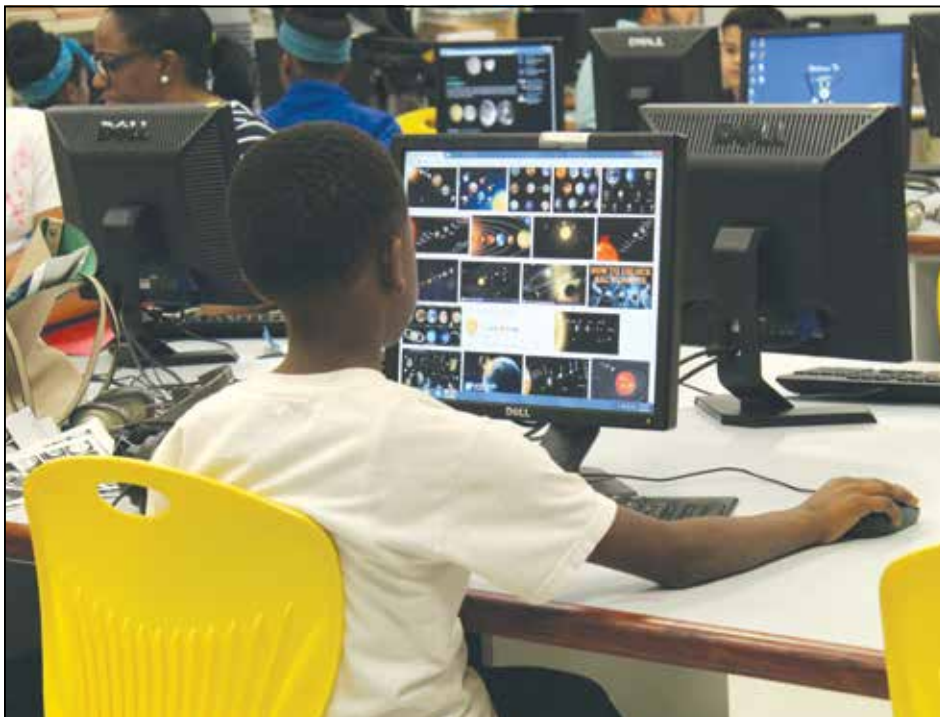
Computers were provided to help students and their families research information for their individual projects.