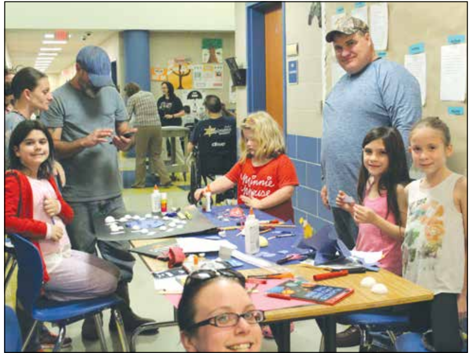
Students and many of their respective families showed up to work together on their projects and make the night a success.