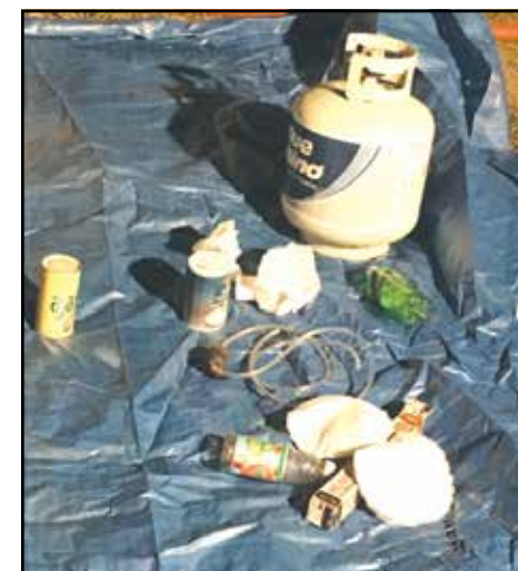
Various items commonly used in the manufacturing of methamphetamine were found inside a camper trailer off East Virtue Street in Chalmette that was being used as a meth lab.

Prison. Frank Peralta and Jacob Warren's bonds have both been set at $100,000 each and Jacqueline Peralta's bond is $40,000.