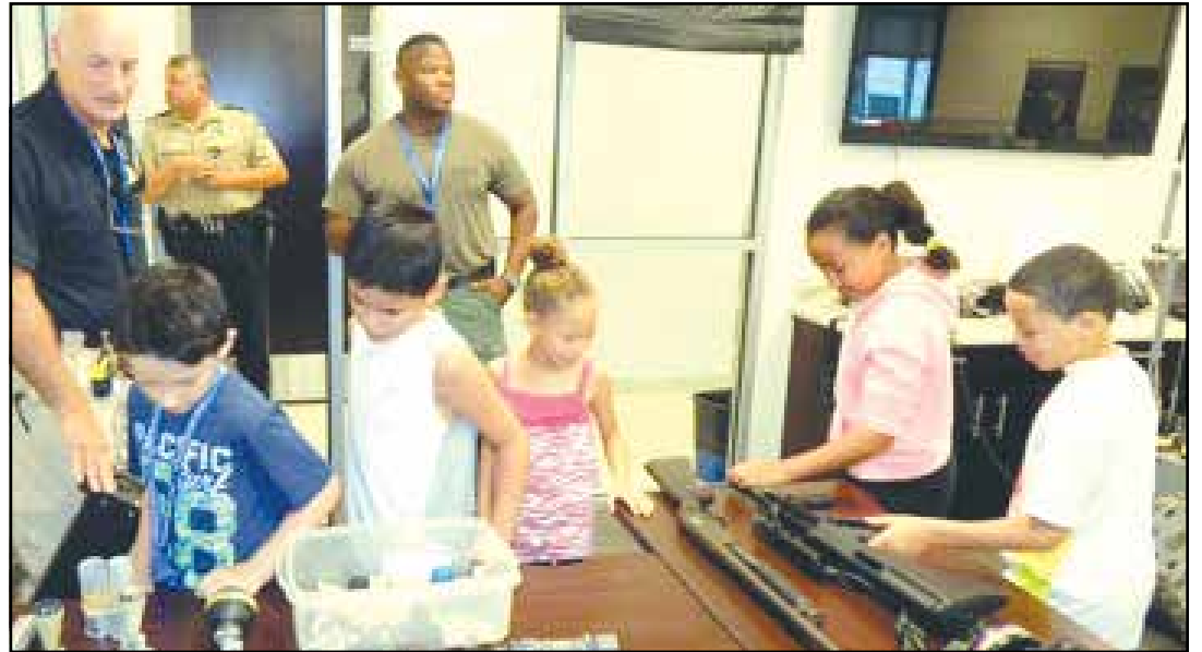
Participants in a previous Junior Deputy Academy examine some of the equipment used by members of the St. Bernard Sheriff's Office. Registration is being held now for this year's academy, which starts June 6.