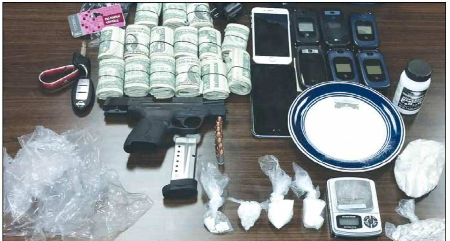
Heroin, crack cocaine, cash, cell phones, a digital scale, miscellaneous drug paraphernalia and a stolen firearm were taken off the streets in the April 18 arrest.