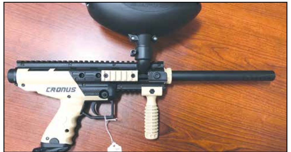
The St. Bernard Sheriff's Office Criminal Investigations Bureau is conducting an ongoing investigation involving more than a dozen incidents where paintball guns similar to this

Individuals can face various felony charges if caught illegally discharging a paintball gun at an individual or property, including aggravated battery and aggravated criminal damage to property, as well as a misdemeanor charge of criminal mischief.