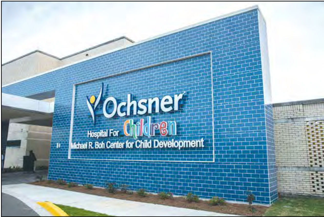
Michael R. Boh Center for Child Development.

Autism spectrum disorder affects one in every 54 children in the United States, making access to healthcare resources critically important for families of children with this neurodevelopmental disorder. With the opening of its new multi-disciplinary Autism Clinic, the Michael R. Boh Center for Child Development at Ochsner Hospital for Children is expanding access in the Gulf South to specialized behavioral and educational programs designed to assess and treat Autism spectrum disorder.