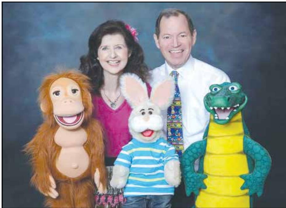
Harvey Rabbit and Friends.

Patrons can stay up-to-date by visiting the library's summer reading website or by liking the library's Facebook page. Information is also available by visiting the library Monday through Thursday 9 a.m. to 6 p.m., Friday 9 a.m. to 5 p.m. and Saturday 9 a.m. to 2 p.m. or calling us at 504-279-0448.