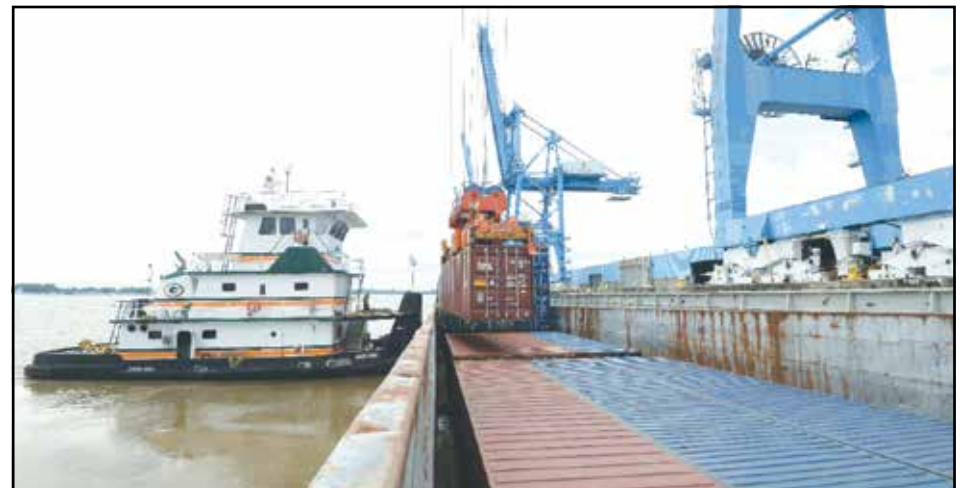
The Louisiana International Terminal will have access to Port NOLA's existing connectivity between the river, rail, and road via six Class I railroads, interstate highways, and the Port's successful container-on-barge operations in partnership with the Port of Baton Rouge and Seacor Marine.