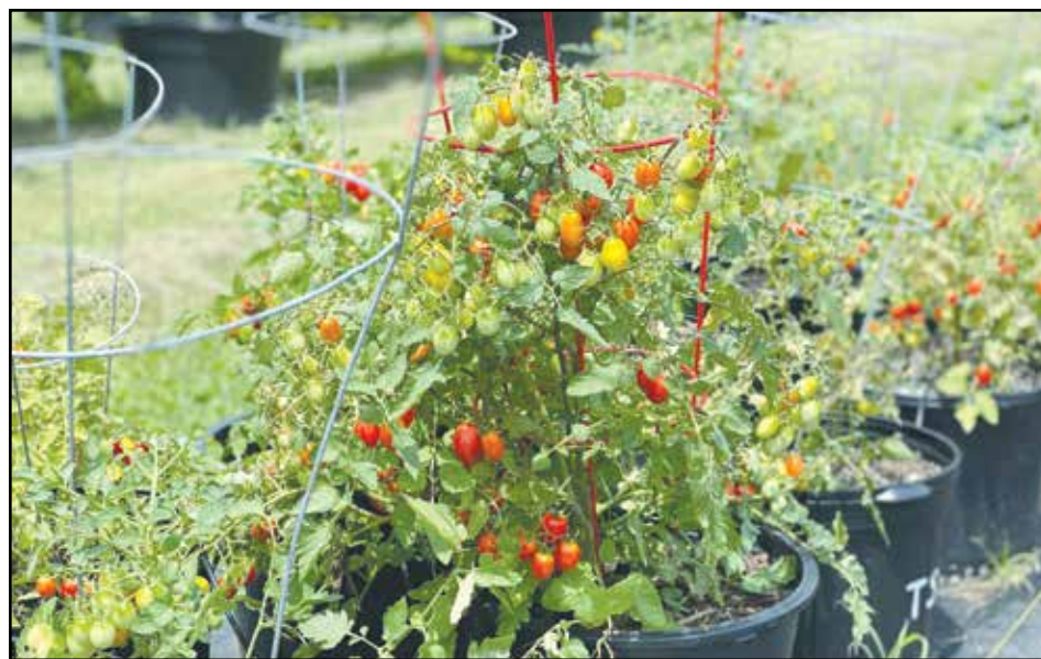
Containers 10 gallons and larger are great for vegetable production.

AgCenter conducted by myself and vegetable specialist Kiki Fontenot are showing promising results (not yet published).