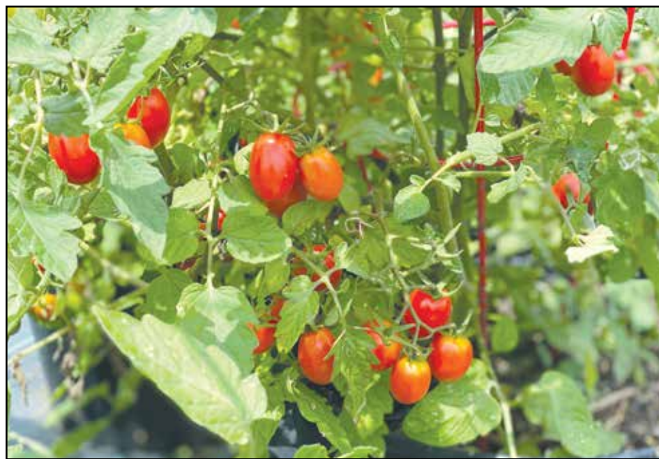
Vegetables such as tomatoes can be very productive in containers.

Homeowners and small-scale vegetables producers alike have been rising to the challenge of the endless rain and diseases encouraged by wet and hot conditions by switching to container-grown vegetables. University studies here at the LSU