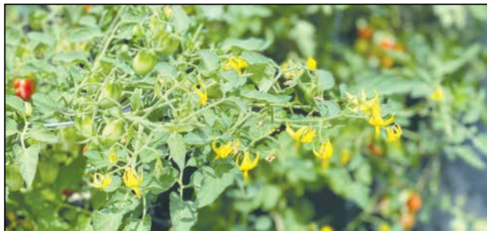
A good slow-release fertilizer and use of liquid fertilizer when needed will help produce the most flowers and fruit.